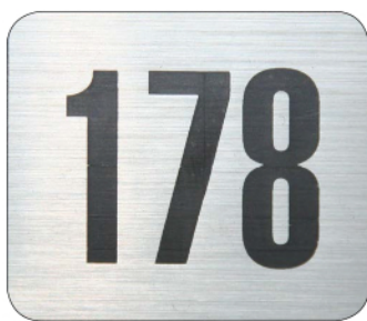
(Actual Size Shown)