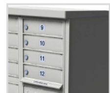
Postal Grey* (PG)