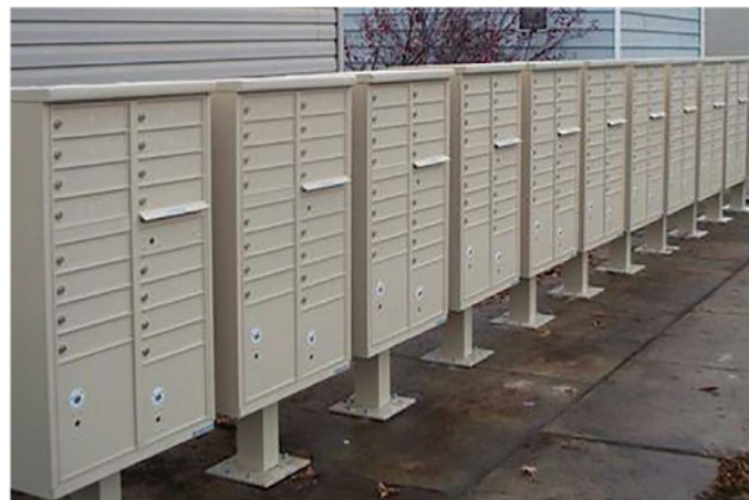
CBUs accommodate both mail and packages while providing greater security.