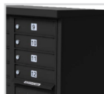
Dark Bronze (DB)