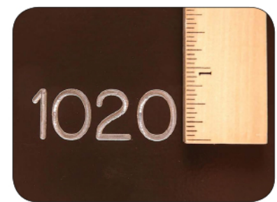
(Optional Engraving into Aluminum Door)

Engraving: Custom engraving utilizes the USPS Standard US Block font and is 3/4" tall. All engraving can include up to 12 characters.