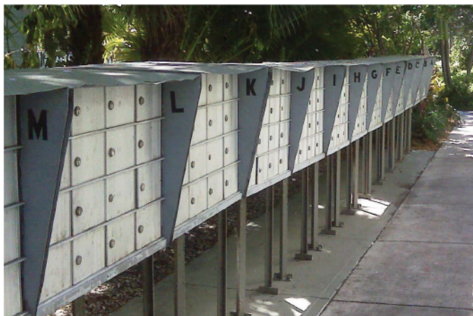
Obsolete NDCBUs are no longer permitted for replacement or new installations.

Dress up your basic CBU with decorative accessories in two distinct styles to fit your neighborhood. (see page 11 for product details)